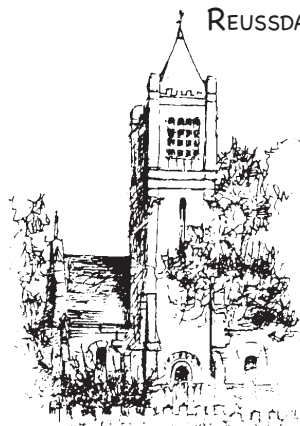
ST JOHN'S CHURCH