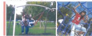
ACTIVE PLAY AREA

Attractive equipment provides challenge for children of varying ages.