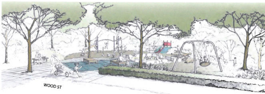
PERSPECTIVE OF PLAYGROUND FROM WOOD STREET

A new local playground is proposed at Wood Street, with direct surveillance from the street. Consultation with local children preceded the design process, and the playground design is richly informed by some of their enthusiastic suggestions.