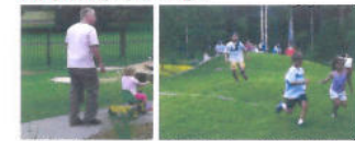
INFORMAL PLAY AREA

A circular path around a grassed area provides a trike circuit for children, as well as an informal play space.