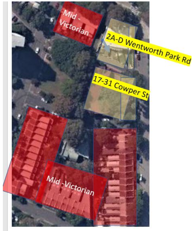
Figure 2 The historical and architectural context of the subject sites

Fig 6, below, shows the impact of replacing the existing low-rise buildings with mid-rise buildings.