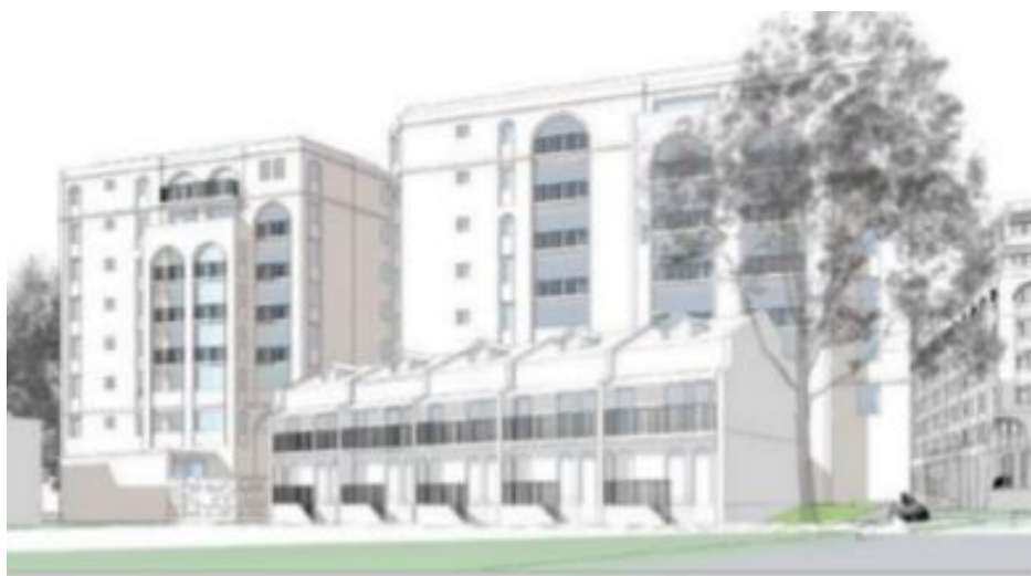
Figure 6 The Mitchell Lane elevation of proposed scheme

Redrawing the boundaries of the HCA to exclude these sites is illogical, it is only an adjustment on paper. Physically it makes no sense, particularly in terms of its impact on streetscape and context, it does not lessen the impact changing the development on these blocks from Neutral (low rise) to Detracting (mid rise) will have on the HCA. The suggestion that the inclusion of five new three story terrace houses along Mitchell Lane will screen an eight storey building is both ludicrous and tokenistic.