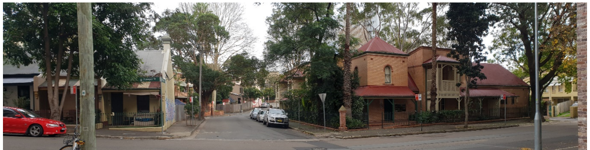
Figure 4 The Cowper St elevation of the south site , on the right, showing its relationship to the mid-Victorian single storey terraces which adjoin it to the south