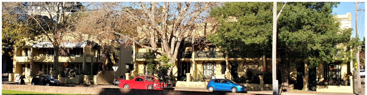
Figure 3 2A-D Wentworth Park Rd (the north site) is on the left. It adjoins six mid-Victorian row houses, Premier Terrace