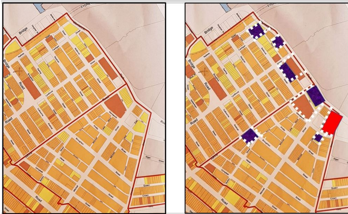
Figure 7 The maps above show how the proposed excision of the north and south sites from the HCA (on the right hand map the white dotted lines represent the proposed boundary changes and the sites are marked in red) in order to replace Neutral scale buildings with Detracting ones is opportunistic and is not based on a logical boundary of the HCA. The sites marked in blue on the right hand map show how if this corrosive principle is accepted it could further compromise the HCAs by redrawing HCA boundaries to enable Neutral infill to be replaced with Detracting mid-rise development.

In seeking to justify the removal of the two sites from the HCA and the increased height limits and FSRs the planning proposal argues that the changes are acceptable because they will deliver a built form which responds to the surrounding context including recent development to the east of the site.