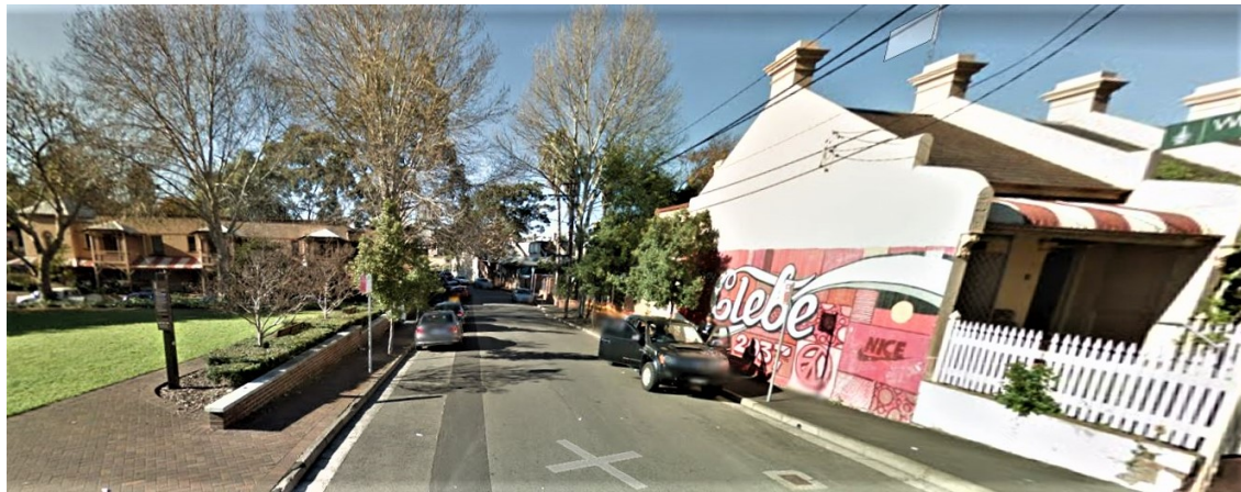
Figure 5 The Mitchell Lane elevation of the south site showing its relationship to the mid-Victorian terraces facing Wentworth Street