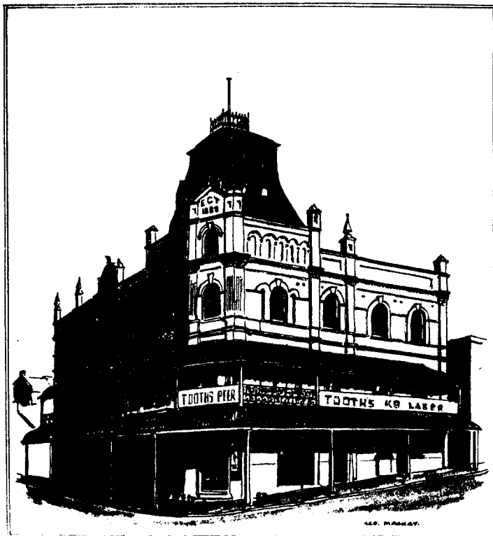
THE OLD HAROLD PARK HOTEL AT THE CORNER OF ROSS STREET AND WIGRAM ROAD. FORMERLY KNOWN AS THE LILLYBRIDGE HOTEL, IT WAS ERECTED IN 1888 AND DEMOLISHED IN 1959.