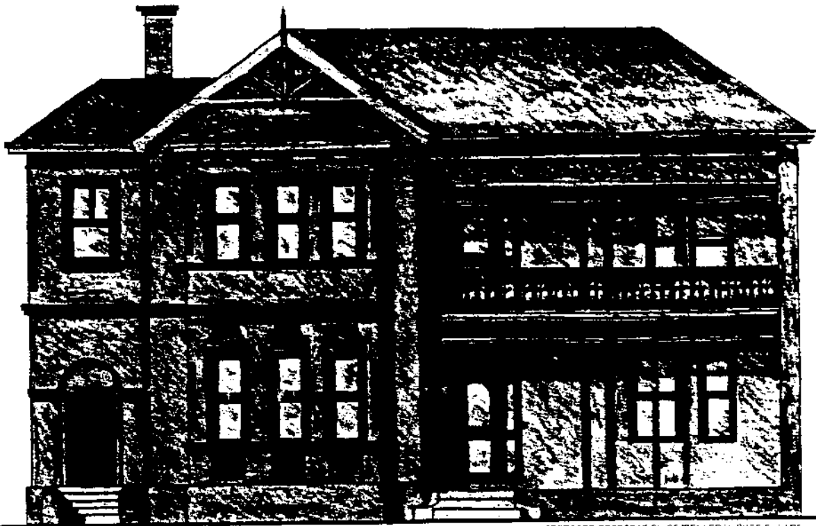
A PROPOSED RESTORATION OF 'BENLIP' HOUSE FACADE