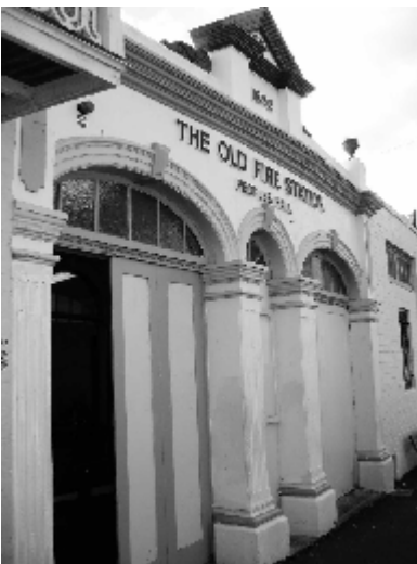
The Old Fire Station, Mitchell Street.