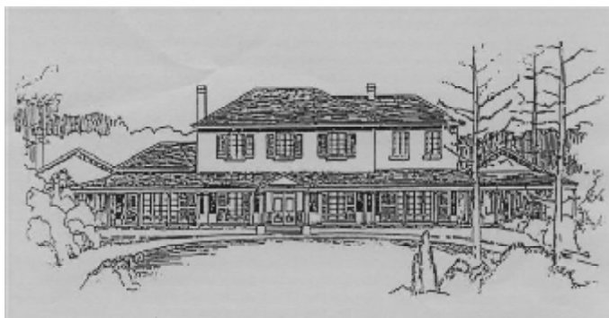
Toxteth Park - John Verge's 1831 Regency original. From St Scholastica's leaflet about the building