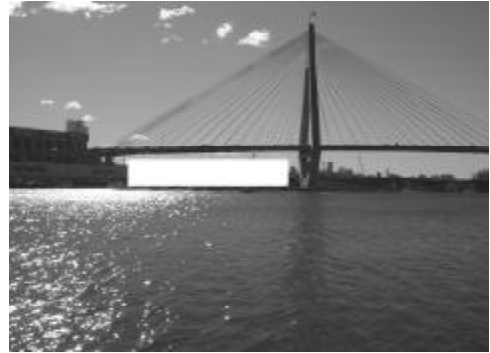
The proposed Slipway building would be the size of the white area.

On Thursday 5 August, over 150 local residents filled the upstairs meeting room in the Glebe Town Hall to discuss two major proposals for developments in Rozelle Bay. One is for the proposed Sydney Slipways boat repair and maintenance facility, which apart from other adverse effects would mar the view of the Anzac Bridge. The other is a facility for dry storage of 850 vessels on the northern side of Rozelle Bay proposed to be built where the existing tall grey coloured Hobbs shed stands.