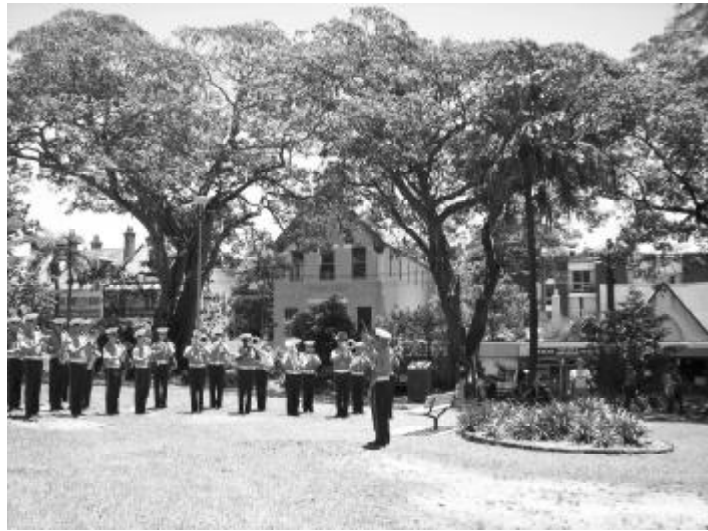
Foley Park in need of repair - November 2005.