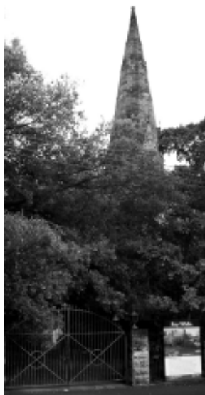
The Abbey up for sale.

confidential, but we look forward to learning who are to be our new neighbours.