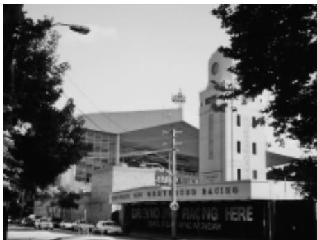
The now-demolished entrance plaza seen from Wentworth Park Road.