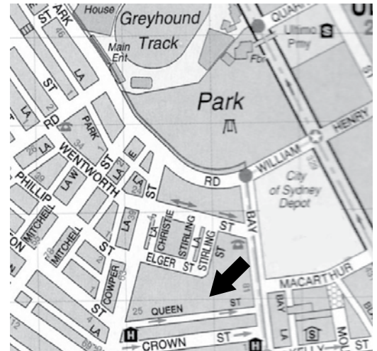
Map showing the location of the 'affordable' housing project.