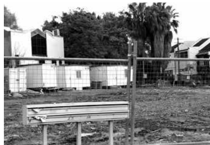
Letter boxes are all that remain on this part of the site.

The site itself does not contain buildings of Heritage value (although it does contain at least one element that should be conserved; the foundation stone laid by