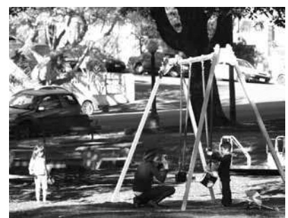
Kids playing in Jubilee Park.