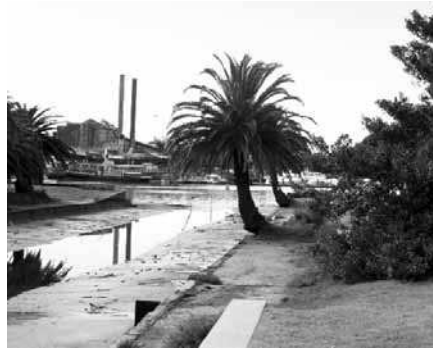
Palm trees and saltmarsh.

Palms do not have extensive root systems, nor do they have spreading canopies. As far as I know they are not allelopathic 2 . It could be that Council is aware of evidence of adverse effects