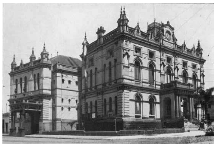
sound. Over its life until now View of Glebe Town Hall showing the portico to Mt Vernon Street, now demolished. From the 1935 City of Sydney Annual Report

Friday 2 December, 6 - 8pm - Glebe Society Christmas Party. See flyer.