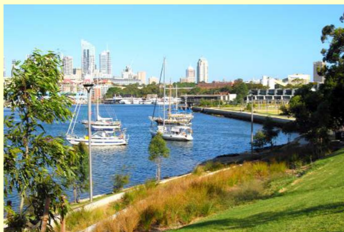
The Glebe foreshore walk in January 2008.