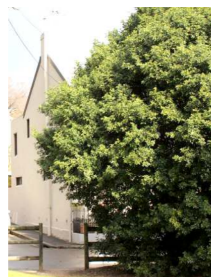
A murraya last year, before pruning.