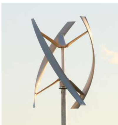
The wind turbine that powers Earth v Sky .

digital snapshot of the twilight sky and projects contrasting hues onto the leaves and branches using LED lights, producing a changing display as the night progresses.