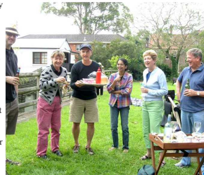
Some local residents enjoying John Street Reserve a few months ago.

This article follows the City of Sydney Council's decision to effectively change the use of the much loved John Street Reserve from a passive recreation park and the Council's proposals for the tennis court complex upgrade. The approved concept decision for the Reserve fences off the most used, sunny, 40% of the Reserve to construct a series of 18 large brick/timber plots for a community garden, together with potting sheds, compost bins, water tanks and tables.