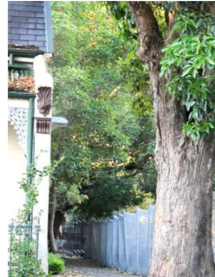
The entrance to Elsie Walk.

On Monday afternoon 28 May the Lord Mayor, Clover Moore, will 'name' the laneway running between Derwent Street and Derwent Lane, adjacent to the western end of Glebe Public School, as Elsie Walk. The laneway was dedicated to Leichhardt Municipal Council by the School in 1993.