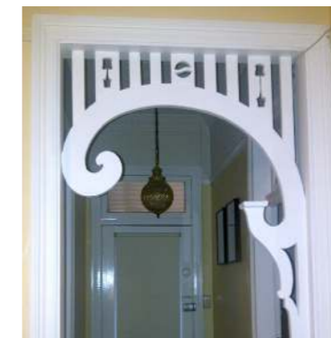
An example of a Federation portière .

Ian Evans' book, The Federation House , states that 'entrance halls had a portière curtain draped behind