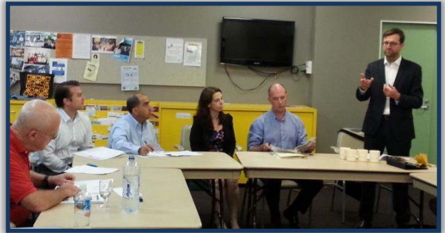
City of Sydney Council visit the April Glebe Society Management Committee meeting

members made their own submissions in addition to those of the Society. Details of the exhibition period and further public consultation should be available soon.