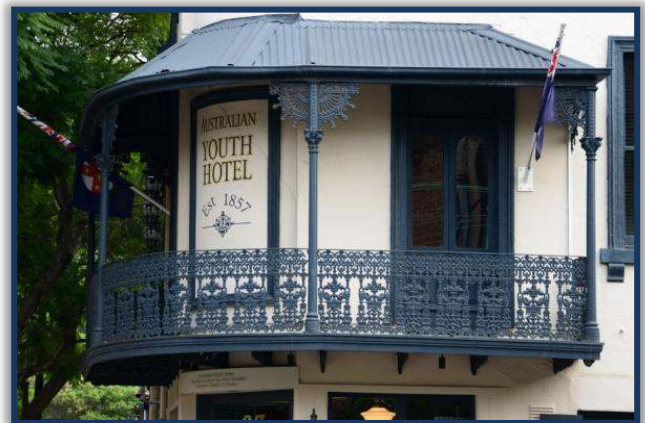
Cantilevered balcony, Australian Youth Hotel

concave striped corrugated iron roof completes the picture – and the picturesque. A ramble westwards up Mitchell St will reveal other cantilevered balconies on former corner shops but numerous examples (some in better condition than others) can be found around Glebe. Another is the Australian Youth Hotel (pre 1867) in Bay St where the cantilevered balcony serves to highlight the curved corner of the building and its entrance below.