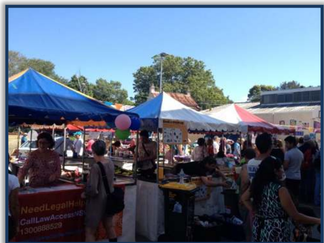
Mitchell St Fete 2013