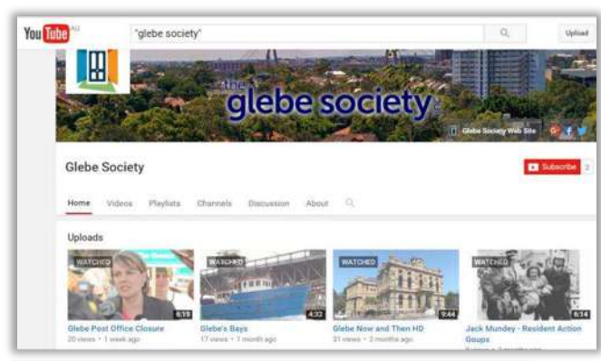
A screenshot of the Glebe Society's YouTube channel