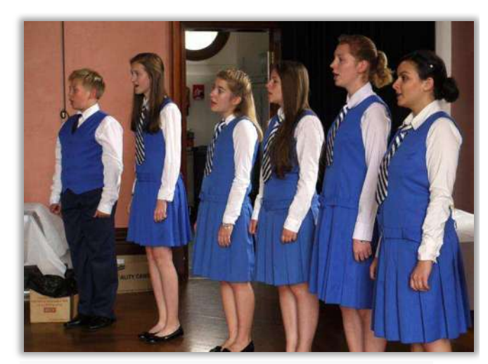
The Czech Philharmonic Children's Choir performing at Glebe Town Hall.