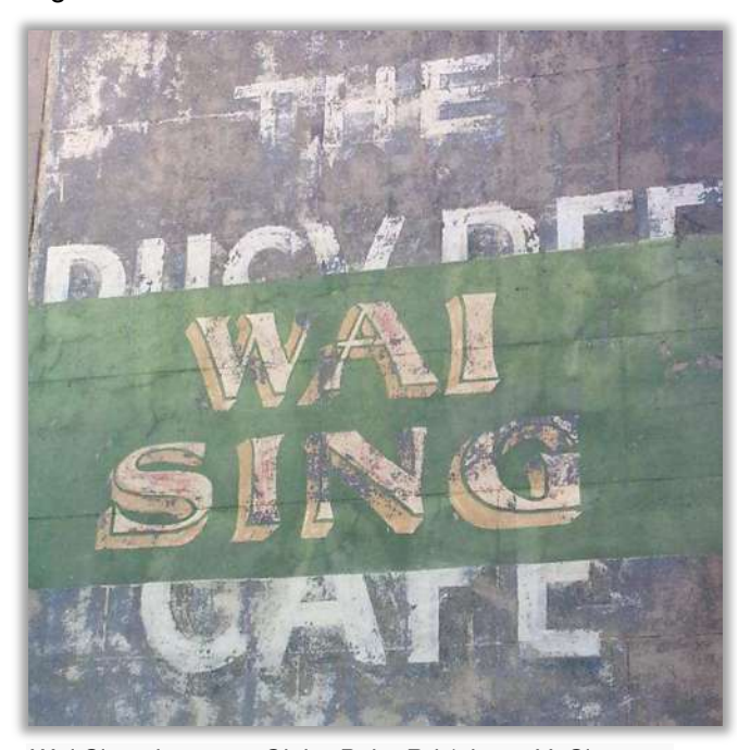
Wai Sing sign at 26 Glebe Point Rd

We understand that Council has written to the tenant raising community concerns about the damage to the old sign; stating that any damage should be made good, in consultation with Council's experts and specifying that in future there should be no interference with the original sign.