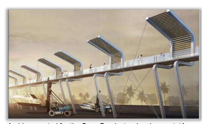
An idea mooted for the Bays Precinct redevelopment. 'A concept similar to New York's High Line, Bays Skywalk is an elevated architectural walkway above the western shore of Rozelle Bay curving around the working harbour along the northern shore'. (http://thebayssydney.com.au/)

We expect the next meeting to be in March. This will obviously be a pivotal point as to whether or not this is a serious consultation process.