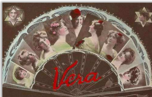
A personalised card, a collage of popular actresses. Stage stars used the picture postcard for publicity. (image provided by Lydia Bushell)

Notes: Images kindly provided by Lydia Bushell.