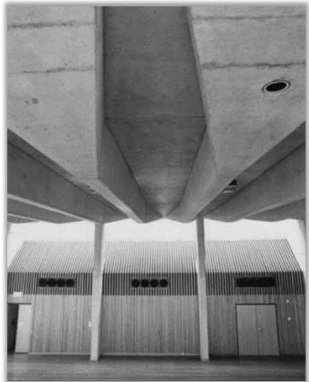
Bidura Auditorium

These requirements of the Court could not be met by amendments to the existing plans, but will require new ones to be drawn that satisfy all these concerns. Given the length of time it took for the refused application to reach the Court, it will probably take just as long for any new proposal to appear, even if the applicant does not decide to on-sell the site, which would obviously add to the timeframe. Although sold in December 2014, the entire site was leased back to the NSW Government until 2017, and they will continue to use the site for at least part of the time required for a future application to be developed.