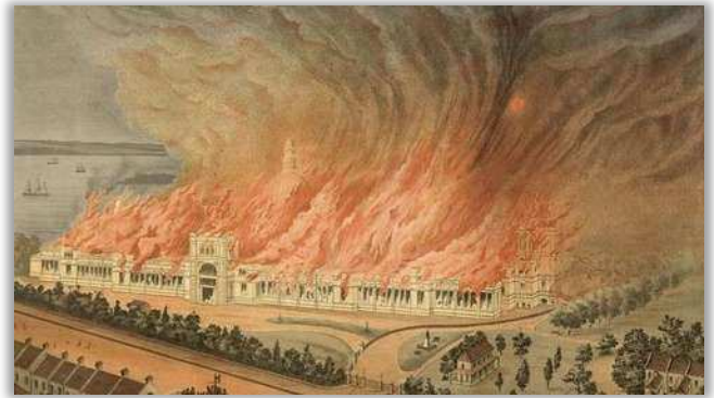
A recreation of the Garden Palace conflagration of 1882