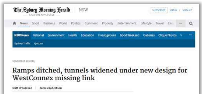
SMH reports on 10 November that WestConnex Camperdown portals will be ditched. ( http://www.smh.com.au/nsw/ramps-ditched-tunnels-widened-under-new-design-for-westconnex-missing-link-20161109-gsifgz.html )