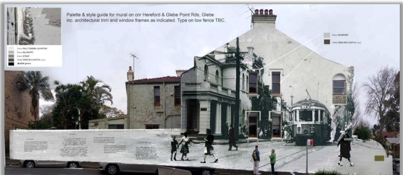
Artist's Impression of the 'Memories of Trams' mural to be painted on the corner of Glebe Point Rd and Hereford St