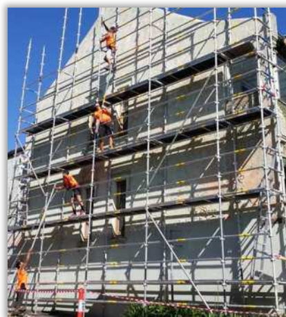
Preparations begin for the 'Memories of Trams' mural.