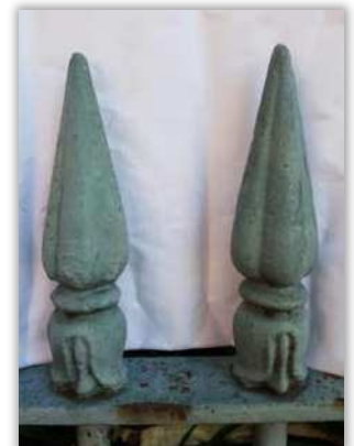
Fence at Emslee, Mansfield St