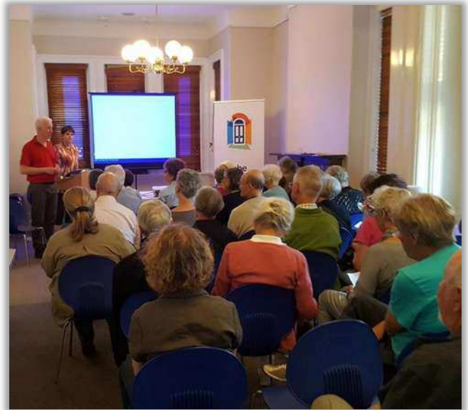
Smartphone 101 event

Virginia Simpson-Young Convenor, Communications