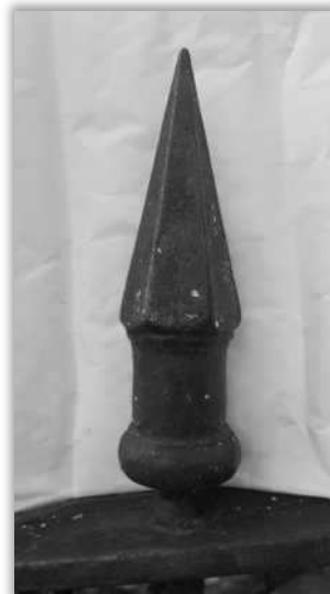
Margaretta Cottage