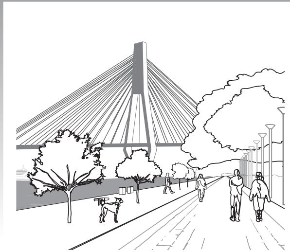
Looking east, towards the Anzac Bridge, on Glebe's newly completed foreshore walk.

You could indicate below the areas where you may be able to help: